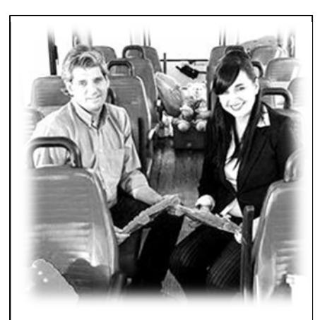
K.I.P. Canada - Family Visitation

Kids with Incarcerated Parents (K.I.P.) was founded in 2011 to support the needs of the over 15,000 children in the Greater Toronto Area that have a parent in the criminal justice system.