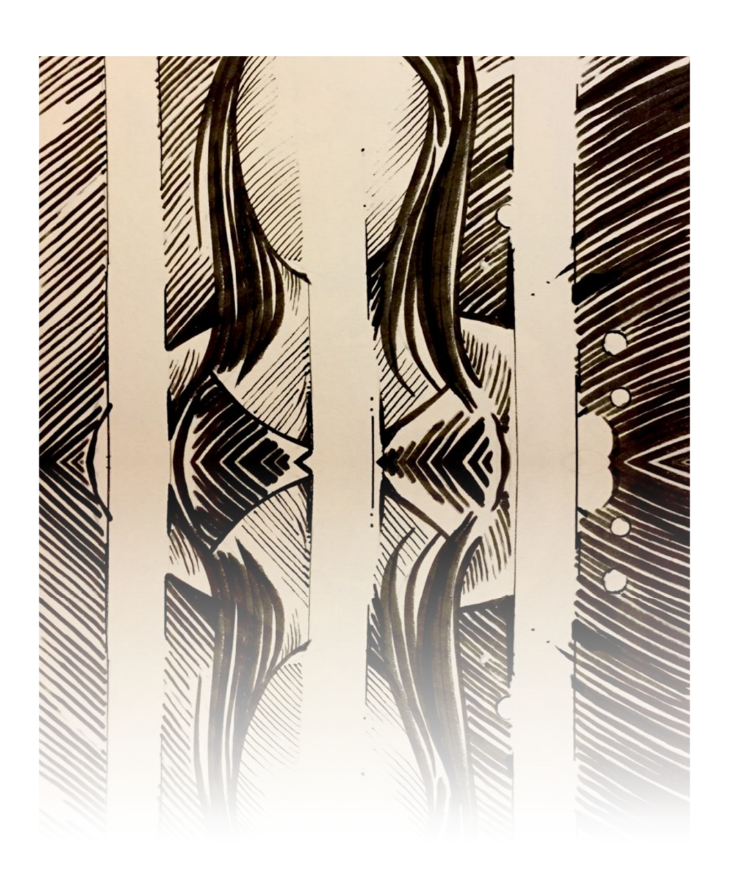
ISSUE #11 - SUMMER 2018